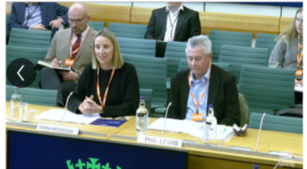
Home Affairs Committee Monday 20 April 2026 Meeting started at 4.35pm

After submitting written evidence to the Home Affairs Select Committee, we were extremely proud that The Anti-Slavery Collective was called as one of two key witnesses in their first inquiry. Dame Karen Bradley MP, chaired a parliamentary Select Committee on "The Impact of Serious and Organised Crime on Local Neighbourhoods".